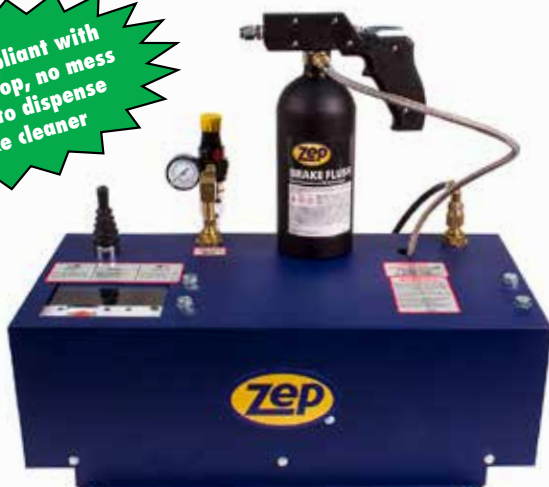
Easy to operate re-fill station

OSHA compliant with a closed loop, no mess system to dispense brake cleaner